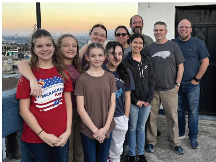
The group arriving in Guatemala ready to serve

Each year, CHCS sixth-graders have the opportunity to embark on a mission trip to Guatemala to serve at the Amigos School and meet their sponsored students. This year, five sixth-grade girls from the North Campus, along with their families, decided to participate. The journey leading up to the trip was filled with many emotions: excitement, nervousness, anticipation, curiosity, a sense of adventure, slight anxiety, and even a bit of fear due to the unknown. These are common feelings for many traveling outside the U.S. for the first time.