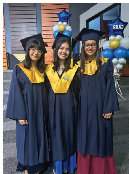
High school graduates