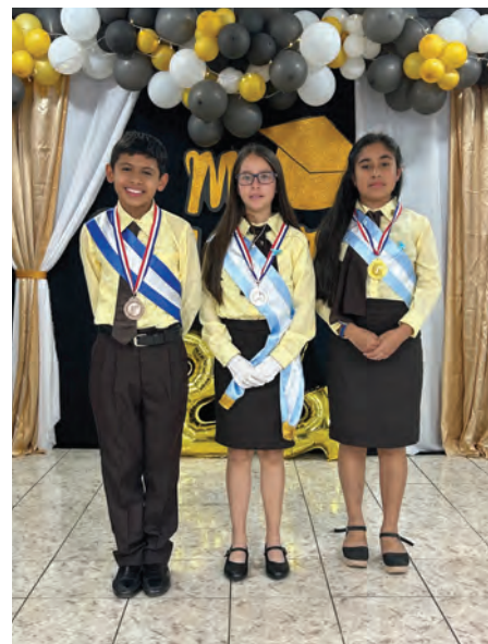
Sponsored students at the top of their class