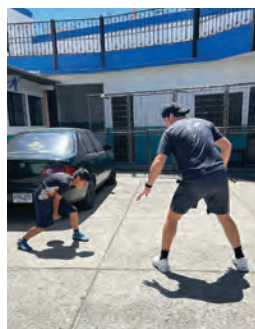
Having fun together playing basketball

It is wonderful when sponsors come to take part in